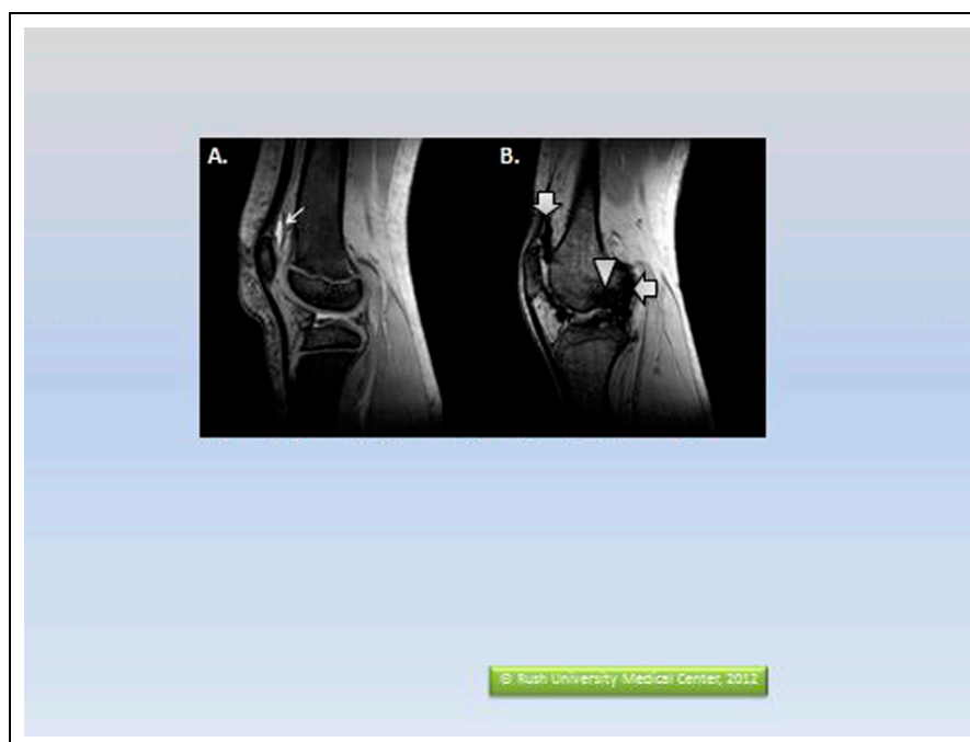
Figure 3. Magnetic resonance images (MRIs) of the knee. A. Normal MRI of the right knee. The arrow indicates a small effusion. B. Abnormal MRI of the right knee. There is hemosiderin-laden synovial hyperplasia (arrows) extending into the central joint space. There are subchondral cysts (triangle) and destruction of the articular cartilage. There is marrow edema within the patella and a subpatellar effusion.

Before the 1980s factor concentrates were prepared from thousands of donors and pooled. The contamination with virus of pooled preparations was common. Patients with hemophilia were at risk for acquiring blood-borne disease, especially human immunodeficiency virus and hepatitis B and C. Starting in 1985 the pooled factor preparations have been treated with heat or solvent detergent, which led to the elimination of the viral contamination risk. Decades ago, the leading cause of death in patients with